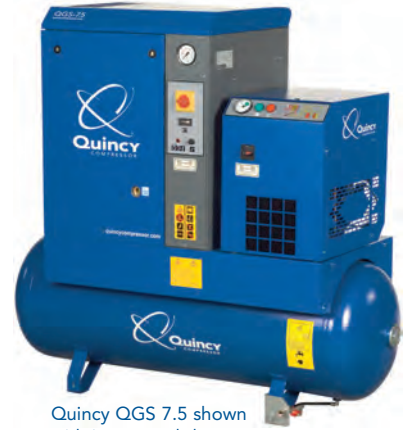
Quincy QGS 7.5 shown with integrated dryer

The Quincy QGS rotary screw air compressor provides compressed air for a wide range of industrial applications. It is the result of over 100 years of compressed air knowledge combined with cutting edge technology and the voice of customers telling us what they want in an air compressor. Quincy QGS provides you with an industrial compressor that is designed around three innovative features that set it apart from other compressors in its class.