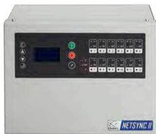
Optional Net$ync II